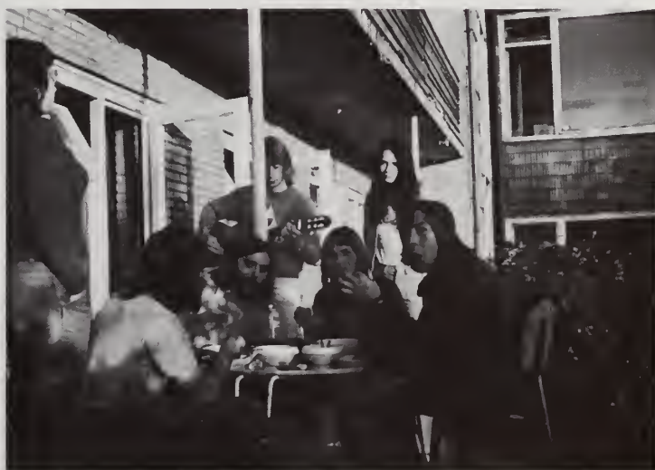
Students enjoy an evening meal on the veranda