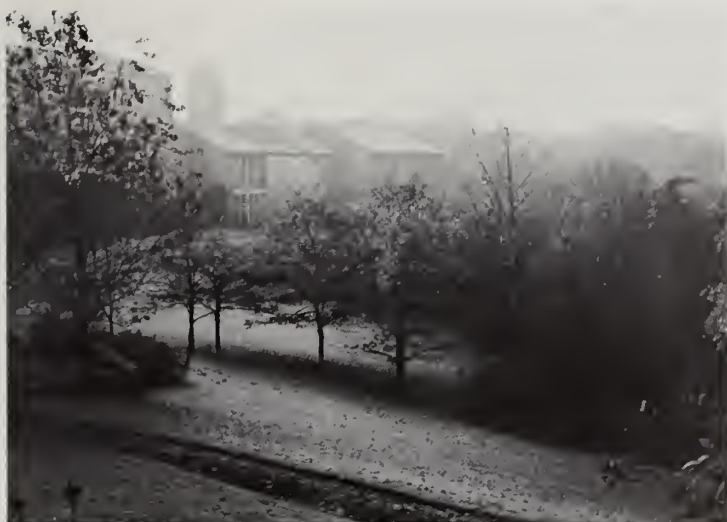
Turn Halle and Bismarck Turm in Wuppertal