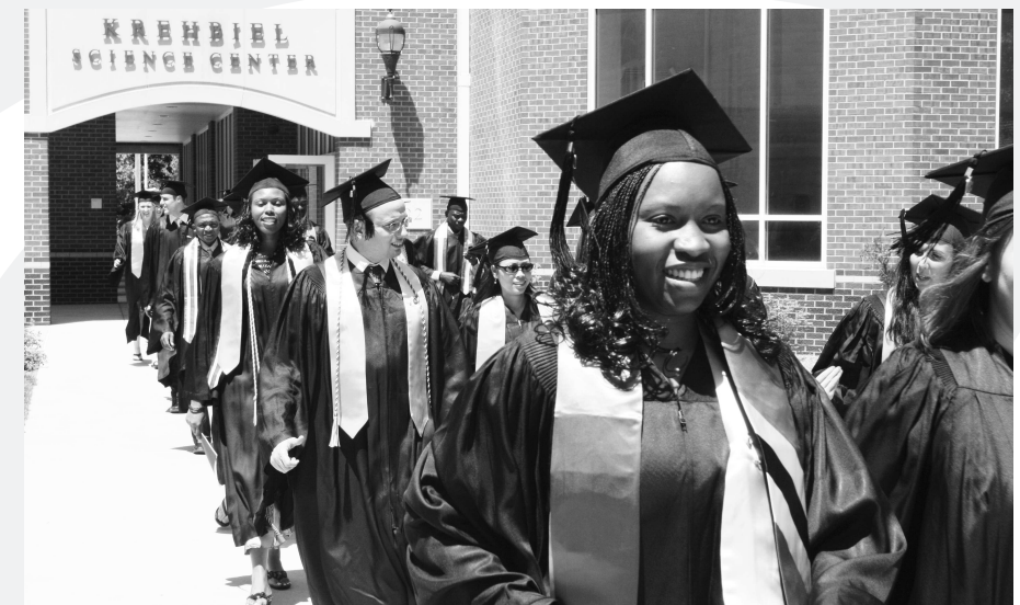
Bethel College commencement 2008